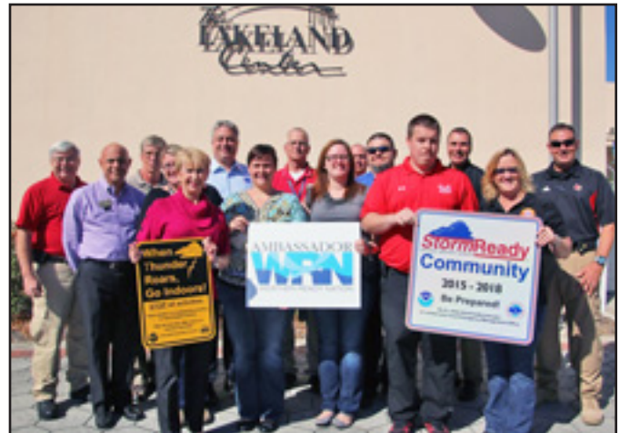
The LakeLand Center, FL, StormReady, Weather-Ready Nation Ambassador, Lightning Toolkit Recognition

The Center is a multi-purpose, open air arena, theatre, and conference center that can host multiple events of up to 20,000 attendees. Lightning is a significant threat in the summer. The center communicates the threat via large display boards, TVs and announcements. Most guests choose to remain inside until the storms have passed rather than race to their vehicles. The Lakeland Center is the hurricane shelter for county equipment and crews and has a strong relationship with Polk County Emergency Management, Fire Rescue and the Lakeland Police Department, all of which attended the recognition ceremony to celebrate the center's achievement.