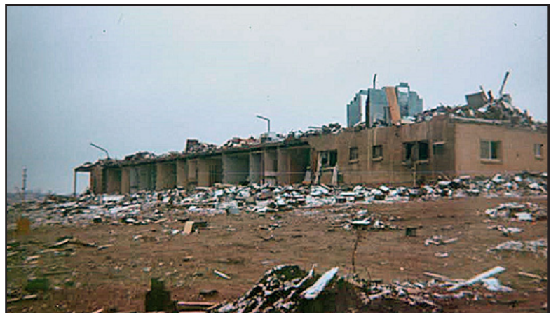
Top floor of a two story motel destroyed except for a section of one interior wall, which would equal EF-3 damage on the Enhanced Fujita scale.

Technology became a focus for the event. With newer tools, the NWS website includes a revised tornado path for the F-4 tornado that killed six people northwest of Grand Rapids. The original path length of 24 miles was increased to 34 miles and EF-3 damage was estimated from photos of a damaged motel (see graphic). This reanalysis project will continue until all known tornadoes in the Grand Rapids County Warning Area on April 11, 1965, are mapped and their damage estimated.