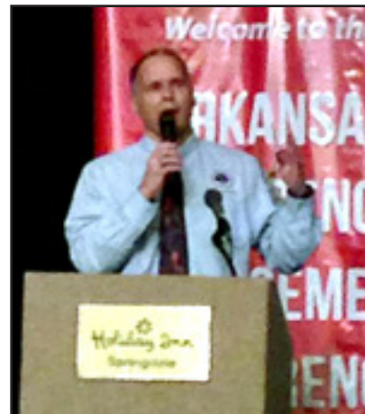
NWS Little Rock, AR, Meteorologist in Charge presents new webinar concept at Arkansas EMA meeting.

In addition to the statewide weather briefings, NWS Little Rock is working to implement a statewide Decision Support webpage, which the office plans to make operational later this fall.