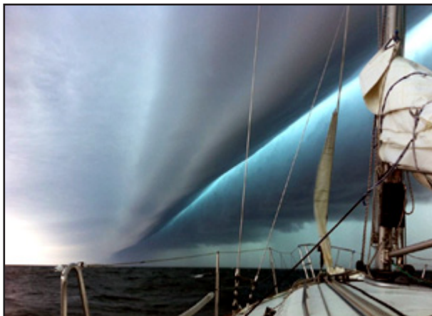
This weather system generated a meteotsunami in June 2013.