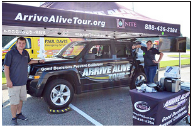
Emergency response vehicles and resources, such as the Arrive Alive Tour by Unite (texting and driving virtual vehicle simulator) kept public interest high.

Volunteers distributed free safety preparedness literature, such as how to build an emergency supply kit and develop a family emergency communications plan. Also available was information on fire safety and prevention and how to prepare for natural disasters such as floods and tornadoes. Volunteers also offered training in first aid and CPR and an introduction to 211.