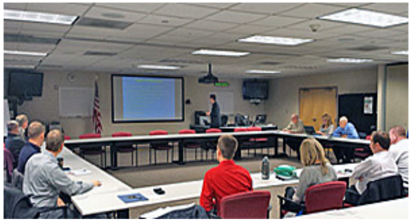
Attendees at the central Ohio Integrated Warning Team meeting focused on snow squalls and their impact on roads and other emergency services among many vital topics.

The feedback from the meeting was positive, and highlighted the need to effectively communicate a clear, consistent message for weather hazards and to work together to ensure these messages are delivered.