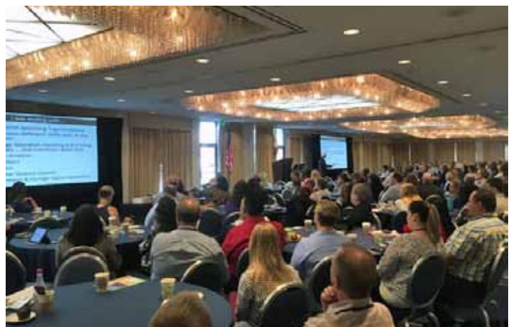
EMs discuss leadership and outreach. Did you know 70 percent of emails go unread but 80 percent of SMS text messages are read.

NWS staff also attended presentations on the new California and USGS early warning system for earthquakes and the San Bernardino terrorism attacks.