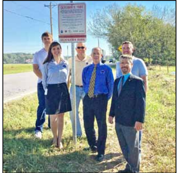
NWS Tulsa, OK, and ABRFC staff proudly display the newly installed High Water Mark sign, installed to prevent future loss of life during flood events.

The Arkansas River at Tulsa crested at 25.21 feet on October 5, 1986, causing flooding in Sand Springs, Tulsa, Jenks and Bixby. Thousands of properties were flooded, causing $63.5 million in damages in Tulsa County ($137.4 million in 2016 dollars) alone.