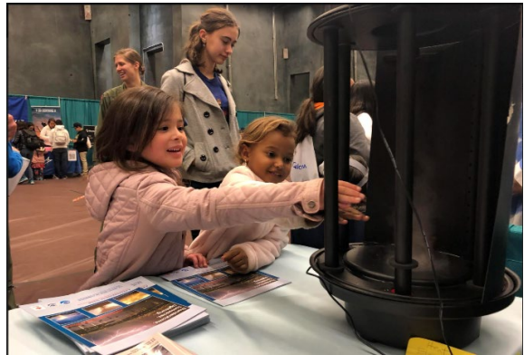
Two girls take a "hands-on" approach to learning about tornados at the San Diego High Tech Fair in Balboa Park, San Diego CA. The Tornado Chamber was a big hit with students and parents. The National Weather Service in San Diego was an exhibitor for the 2-day event.

Best alt text: Our pictures communicate a lot about our work, but we need to make sure that information is also available to people who are blind or low-vision. Alternative text, or "alt text" for short, provides a description of what's happening in the image. See WebAIM for guidance.