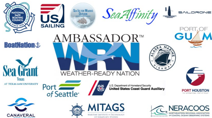
Current WRN Ambassadors identified as Marine Ambassadors

In order to increase weather awareness and safety at sea, the NWS Marine Program, Regions, Ocean Prediction Center, and National Hurricane Center have collaborated to develop the WRN Marine Ambassador network to serve the marine community. Like the parent WRN Ambassador program, WRN Marine Ambassador network recognizes marine organizations that are improving the nation's readiness, responsiveness, and resilience to marine-related weather hazards. There are already nearly 150 current marine-related ambassadors identified among the current WRN Ambassadors. The WRN Ambassador Marine network includes a toolkit to introduce the marine community to NWS marine products and services, marine weather training videos, and safety messaging information for reducing risk to lives and property at sea. The network's goals are to share best practices among the marine/coastal community ambassadors, better communicate improvements of marine-related NWS products and services, and work with the organizations to strengthen preparedness, improve marine resilience, and protect life and safety at sea to build a "Marine Weather-Ready Nation!" It is an opportunity for WRN Marine Ambassadors to be able to influence other maritime organizations and individual commercial and recreational mariners to be better informed and prepared. More information on the WRN Marine Ambassadors can be found here .