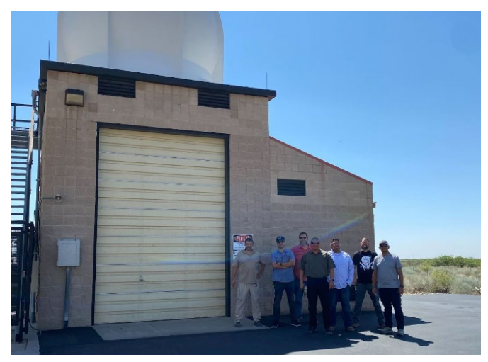
Staff from both the National Weather Service and White Sands Missile Range meet for science sharing and inter-office collaboration.

On July 13, 2022, staff from both NWS El Paso and the White Sands Missile Range (WSMR) Meteorology Branch met at the Weather Forecast Office (WFO) in Santa Teresa, NM for a meet-and-greet and science sharing presentation.