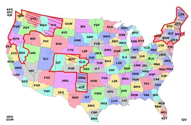
Map depicting the three exercise pods, with Hazard Services sites denoted by hatching

The goal of this exercise is to demonstrate a process that attempts to increase lead time while improving consistency in issuance timing, geographical footprint of winter watches, and key messaging using streamlined collaboration. The Weather Prediction Center (WPC) and select Weather Forecast Offices (WFOs) from each region will focus collaboration on winter watches during