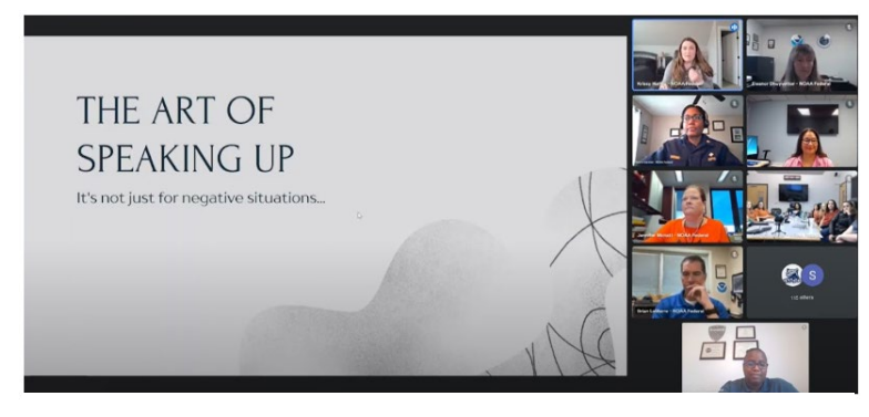
NWS Nashville Meteorologist in Charge, Krissy Hurley, delivering the keynote address on "Speaking Up When Something is Wrong" at the 2022 Southern Region Women's Conference

The afternoon featured 10 specialized breakout sessions designed to create a space for women and allies to learn from each other, share, and connect. Breakout sessions included topics such as "Feeling Alone in a New Office," "Building a Family around Shift Work," and "Resumes, Interviews and Imposter Syndrome." Breakout sessions also included presentations on "FMLA and Parental Rights Basics" from the Office of Human Capital Services and Sexual Assault/Sexual Harassment (SASH) from the NOAA Workplace Violence Prevention and Response program.