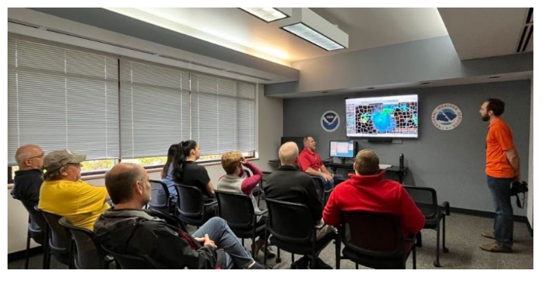
Pictured above is a demonstration at one of the stations

NWS St. Louis hosted their first open house since 2014 on Saturday, October 29, 2022. They welcomed partners such as Emergency Managers to this special open house to thank them for their support and efforts towards a Weather-Ready Nation over the past several years.