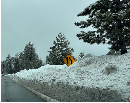
State Highway 18, Arctic Circle, old and new snow in March. This route to Big Bear City was closed for 3 weeks.