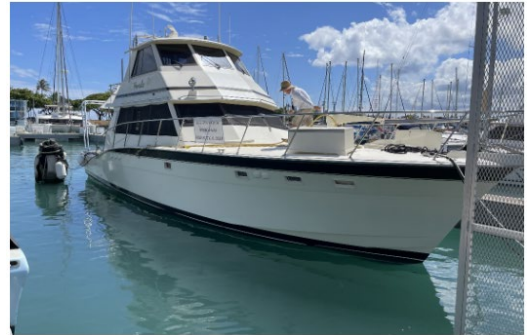
The 60' Hondo transports maintenance crews and other pertinent parties to Oahu's SPM operations.

Many living in the Hawaiian Islands do not fully understand how global crude oil or other petroleum products are received in the islands for either immediate use or future refinement. This visit onboard the Hondo to the SPM allowed HFO marine forecasters to better understand the logistics of PAR's offloading operations and what meteorological situations most impact their operations during SPM. The main weather impacts could be from either a vicinity or landfalling tropical cyclone or any large kona storm producing storm-force winds and resultant high seas that would prevent the safe offloading of product.