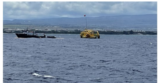
The 60' Hondo transports maintenance crews and other pertinent parties to Oahu's SPM operations.