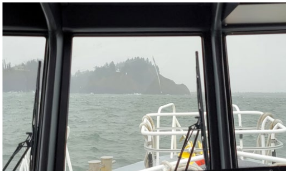
View of Cape Disappointment/Lewis and Clark Interpretive Center at the mouth of the Columbia River Bar important operations.

The bar pilots are highly trained mariners who are the only ones authorized to navigate vessels through the highly dangerous Columbia River Bar. They transfer onto vessels from either a boat using a ladder or from a helicopter that hoists them onto the ship. The helicopter is actually faster and safer for them to use – imagine climbing up a 20 foot rope ladder as