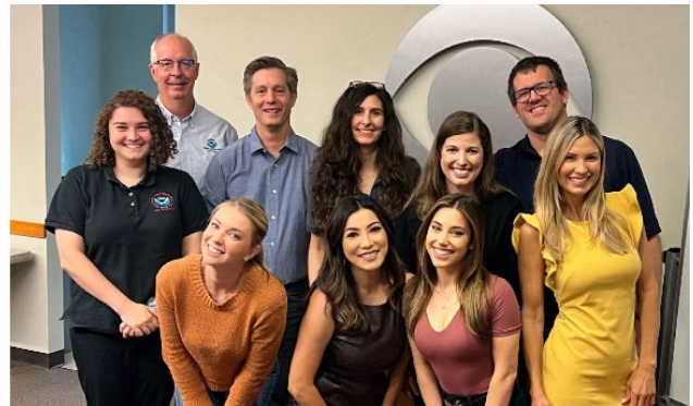
KCBS/KCAL weather team with the NWS Los Angeles/Oxnard staff.