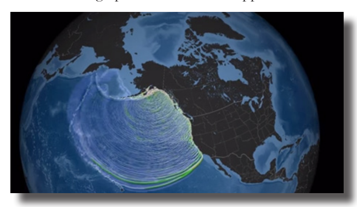
Snapshot from PTWC's animation of the large tsunami generated in Alaska's Prince William Sound in 1964

Seismic networks include the U.S. Geological Survey's Advanced National Seismic System and the Global Seismographic Network. To supplement these