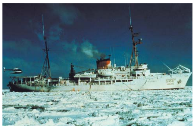
Ship survey of ice in shipping channels