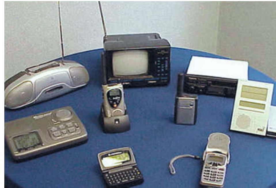
Electronic equipment available to receive weather information/NOAA (Weather Radio, Radio, TV, Pager, Cell Phone, Two-Way Radio)

KEEP AHEAD OF THE STORM by listening to NOAA Weather Radio, commercial radio and television for the latest winter storm warnings, watches and advisories