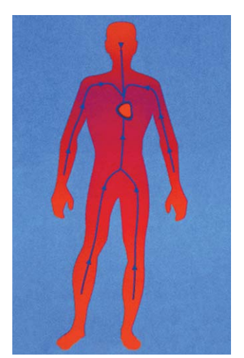
Improperly warming the body will drive cold blood from the extremities to the heart, leading to heart failure

Frostbite is damage to body tissue caused by extreme cold. A wind chill of -20° Fahrenheit (F) will cause frostbite in just 30 minutes. Frostbite causes a loss of feeling and a white or pale appearance in extremities, such as fingers, toes, ear lobes or the tip of the nose. If symptoms are detected, get medical help immediately! If you must wait for help, slowly rewarm affected areas. However, if the person is also showing signs of hypothermia, warm the body core before the extremities.