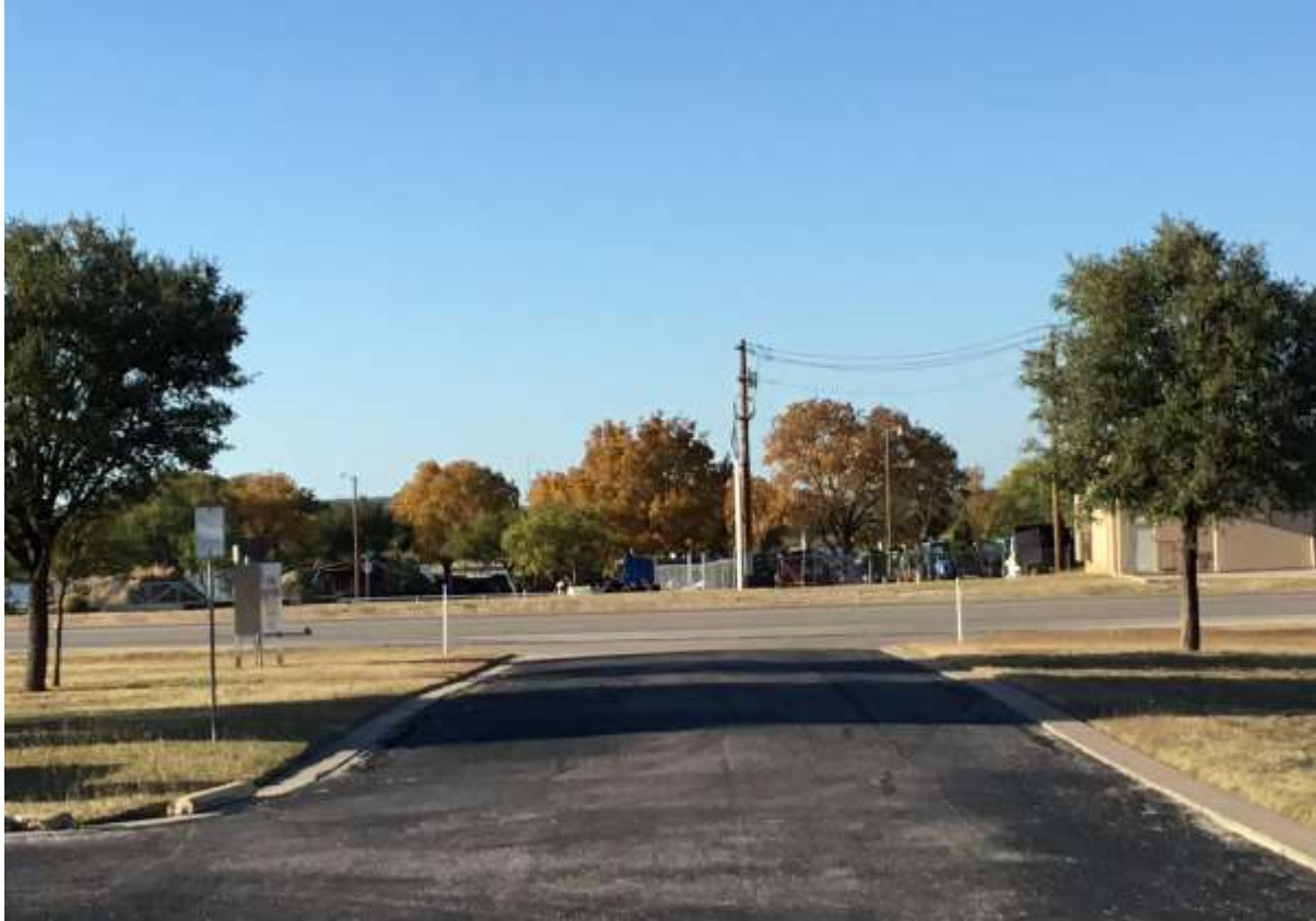
Photo from the National Weather Service Forecast Office in San Angelo, on Nov. 7.

Scattered showers and a few thunderstorms occurred across central and eastern parts of west-central Texas on the late afternoon and evening of Nov. 24, with the arrival of a dryline. Rainfall amounts were less than one quarter of an inch.