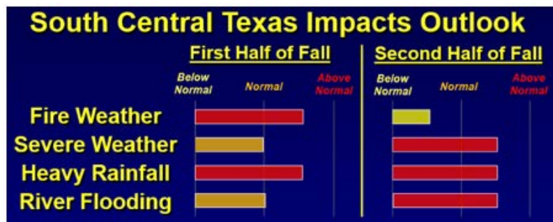
Fig. 2 Example impacts outlook given during the fall 2015 South Central Texas LIBSO briefing on 8 October 2015. This figure is adapted from its original form in that “First Half of Fall” was “October” and “Second Half of Fall” was “November-December.”

Significant wetter (drier) than normal antecedent conditions increase (decrease) the likelihood of flooding while decreasing (increasing) the threat of fire weather and drought going into a particular season, especially when CPC outlooks are forecasting an equal chance of above or below normal precipitation and temperature. Rainfall anomalies are an important antecedent condition that is covered at the beginning of the LIBSO because they are a proxy for soil moisture and potential fuel growth, but streamflow anomalies along with drought indicators and indices are also important. Prior to the fall 2015 webinar, an abnormally dry July-September period following the wettest April-June period on record in Texas (Furl et al. 2018) resulted in 90-day rainfall anomalies that were 10-50% of normal (Fig. 3a), but 180-day rainfall anomalies that were 100-200% of normal (Fig. 3b) across South Central Texas. This triggered the development of a flash drought over the CWA by early fall with below normal streamflow and soil moisture anomalies (not shown) that decreased flood potential going into early fall.