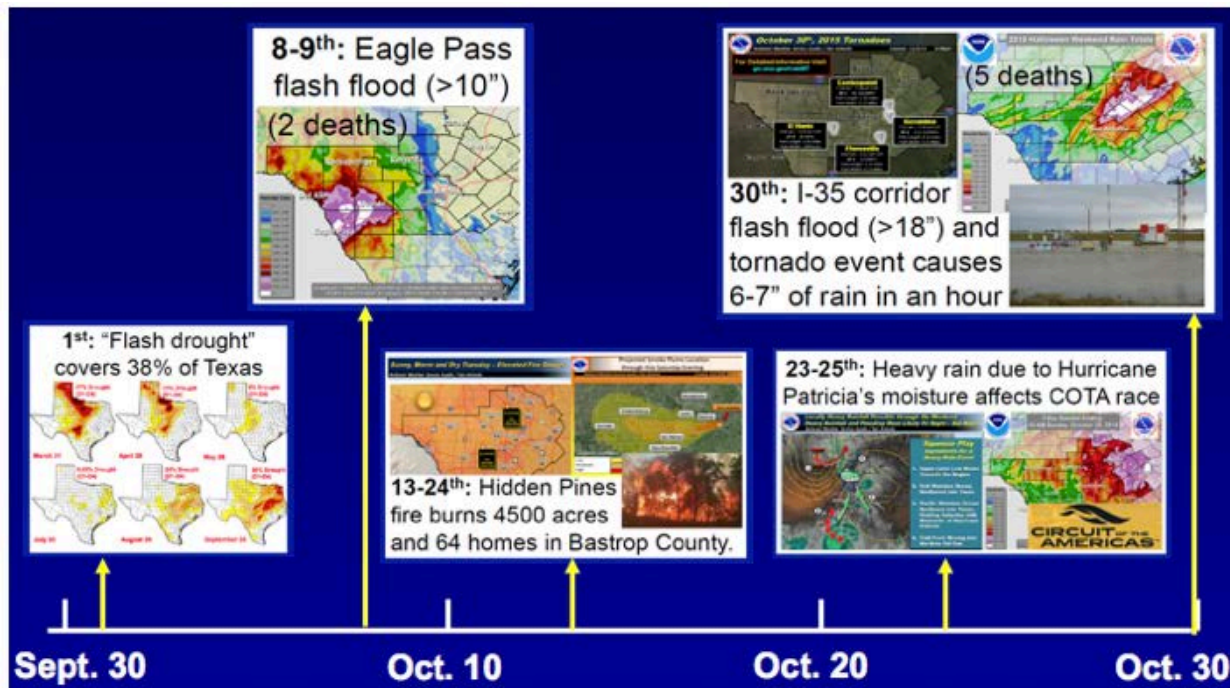
Fig. 4 October 2015 timeline of fire weather, flooding, and severe weather events in South Central Texas.

NOAA's Local Climate Analysis Tool (LCAT; Timofeyeva-Livezey et al. 2015). LCAT analyses (along with figures in P12 and LT08) show that South Central Texas has some of the highest skill scores for precipitation during non-neutral ENSO conditions in all seasons except summer and above average skill for temperature all year regardless of ENSO conditions.