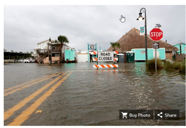
A road closed sign sits at the intersection of Port Leon Drive and Riverside Drive in St. Marks, Florida. The streets are flooded due to Tropical Storm Nestor on Saturday, Oct. 19, 2019.

Operationally, Nestor posed a unique challenge in that The National Hurricane Center began issuing advisories on the system as a Potential Tropical Cyclone and showed it tracking through Tallahassee. Once the system was named Nestor, it was forecast to lose its tropical status before landfall, so no watches or warnings were issued in spite of the track forecast. Nestor ironically produced the most tropical impacts to our area this season (albeit minor) as a post-tropical storm with coastal flooding via storm surge, rainfall, gusty winds, and high surf.