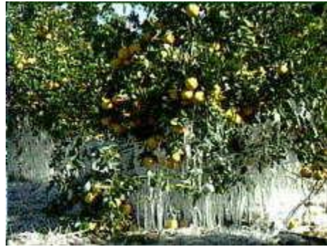
Ice coating applied to citrus crops in Polk County.

After a very wet December, January 2003 did an about-face, with scarce rainfall across much of the Suncoast. Rainfall was near normal in Fort Myers, but most of it fell early New Year's Day. One trend that continued, however, was below normal temperatures. This trend, which began in late November, bottomed out in January. This unusual month saw both top ten dry and top ten chill at many locations on the Suncoast. Tables 1 and 2 show the top ten driest and top ten coldest Januaries for Tampa, respectively.