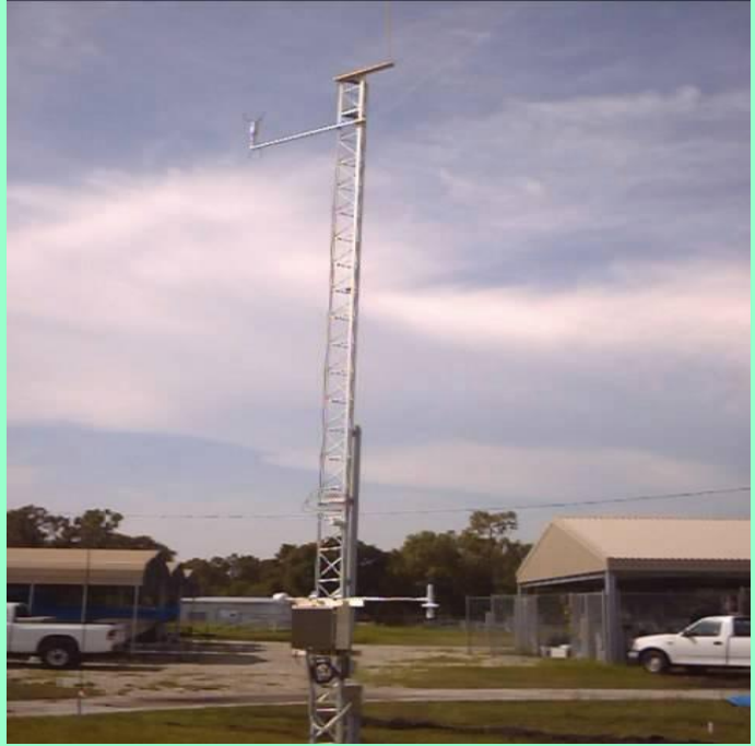
Radiosonde Surface Observing Instrumentation System mast and attached sensors, at NWS Tampa Bay Area in Ruskin.

A Radiosonde Surface Observing Instrumentation System (RSOIS) was installed at NWS Tampa Bay in June 2003. The new, state-of-the-art system is designed to give meteorologists and technicians a desktop display of conditions at the office site so radiosondes can be set up much more efficiently for upper air balloon launches. Now, rather than taking precious time to manually record observations needed to initialize launch data, the radiosonde operators can quickly determine initial conditions at a glance, allowing them more time to concentrate on other important launch sequence activities.