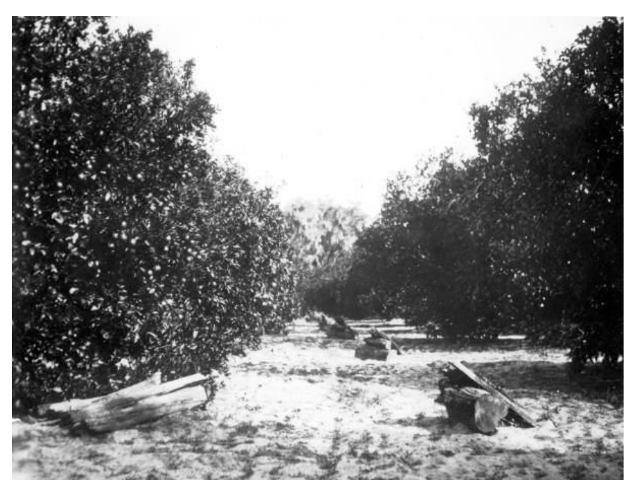
Figure 1. Fat lighters stacked in an orange grove in anticipation of the freeze.

Event severity: Saint Leo, FL 22°F Event severity: Tampa, FL 27°F Crop loss: ~14 million boxes