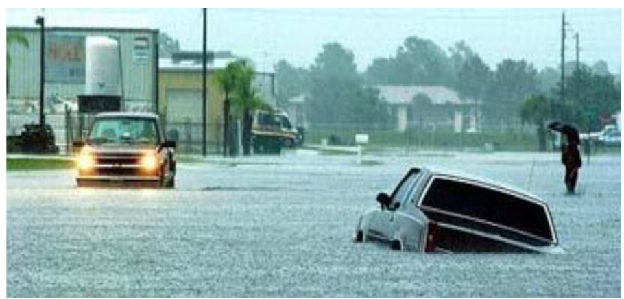
Figure 2. Flooding rains in Charlotte County from Tropical Storm Henri.