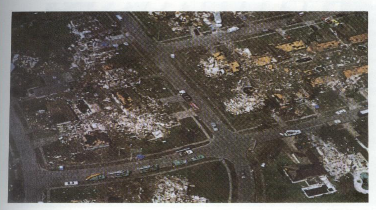
Figure 3. Strong F3 damage to the Beacon Hill subdivision. Construction of homes were either reinforced concrete block or wood frame.