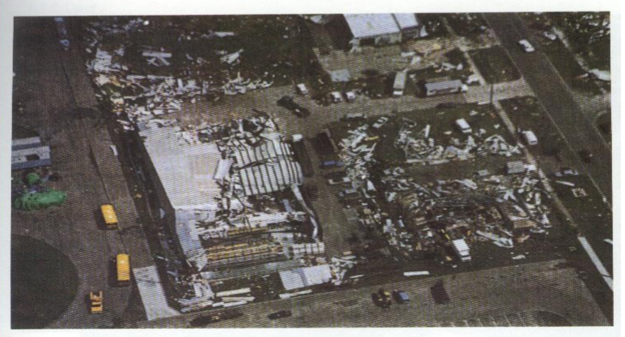
Figure 4. Warehouse buildings heavily damaged by the Pinellas Park tornado.