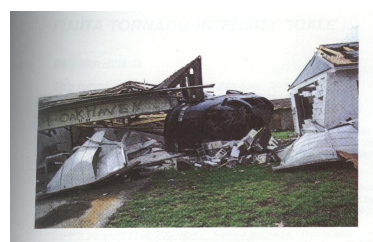
Figure 11. Minivan that became airborne and struck this home in the Beacon Hill subdivision in Pinellas Park.