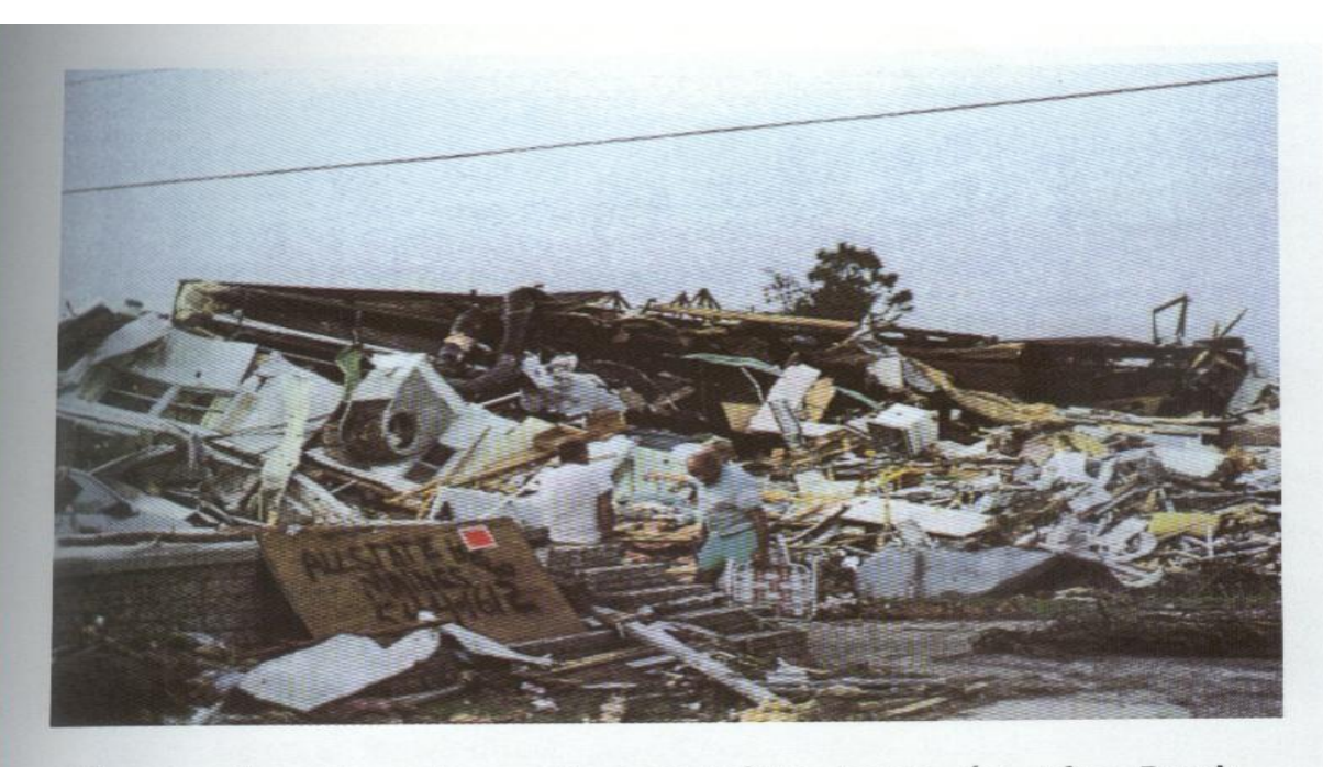
Figure 7. Remains of a mobile home in the Park Royale Village that became airborne and struck a home. One person that was in the mobile home was killed.