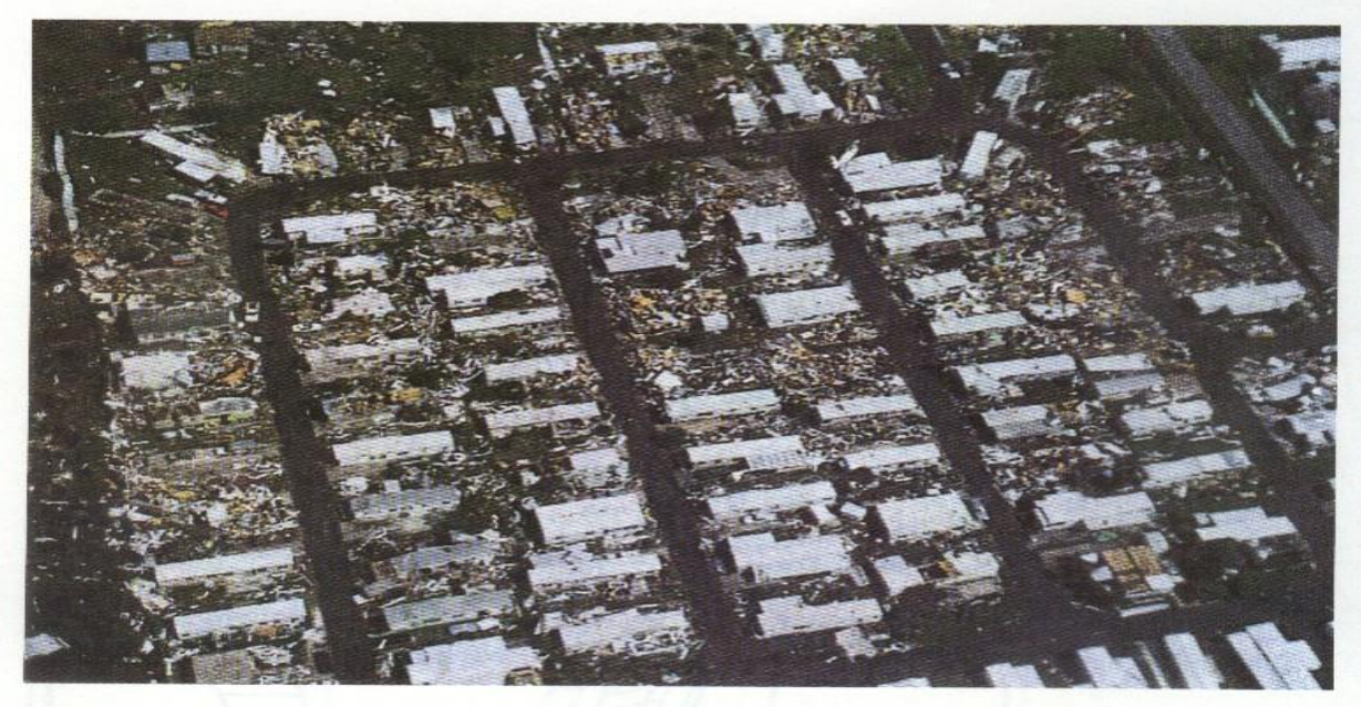
Figure 1. Damage to the Indian Rocks Mobile Home park from the Largo tornado.