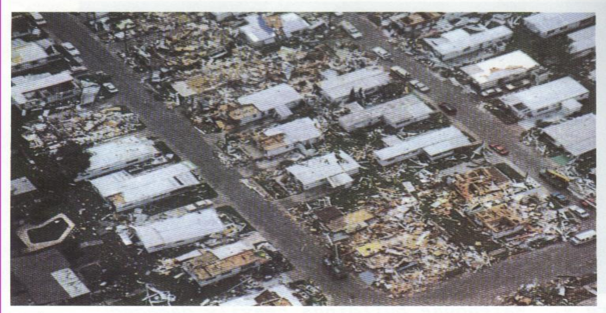
Figure 6. Close-up view of the Park Royale Village mobile home park. Many homes were totally destroyed.