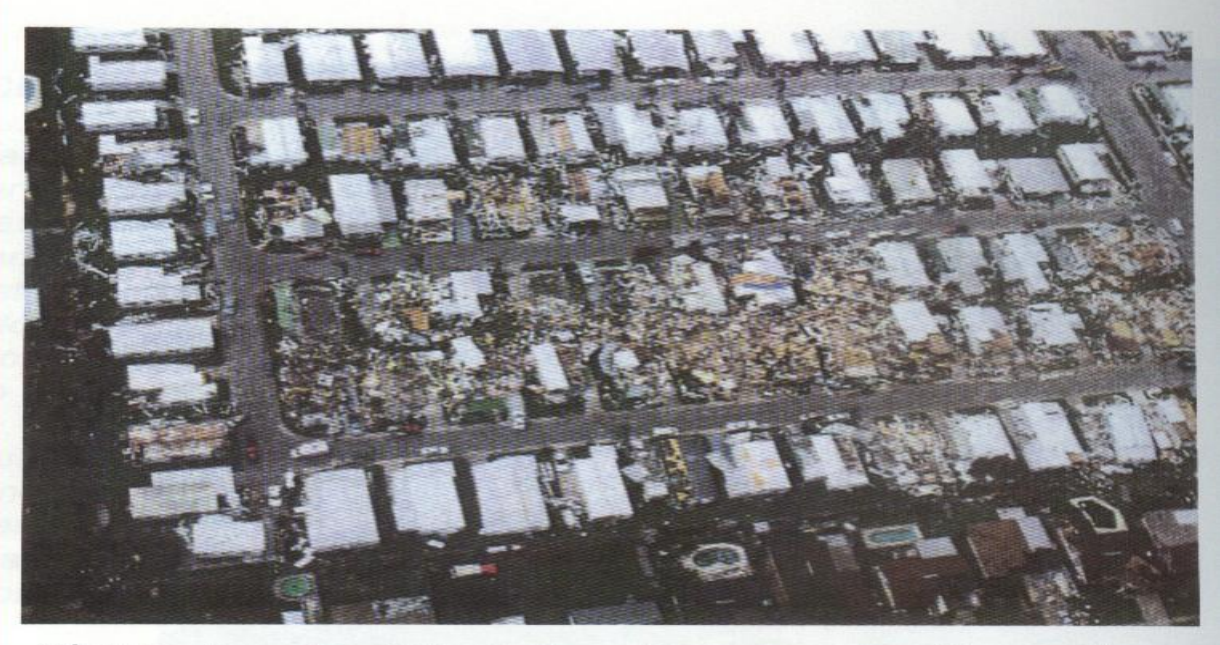
Figure 5. Aerial photo of damage to the Park Royale Village mobile home park from the Pinellas Park tornado. Notice the apparent skipping pattern indicating that the tornado may have become a multiple vortex storm.