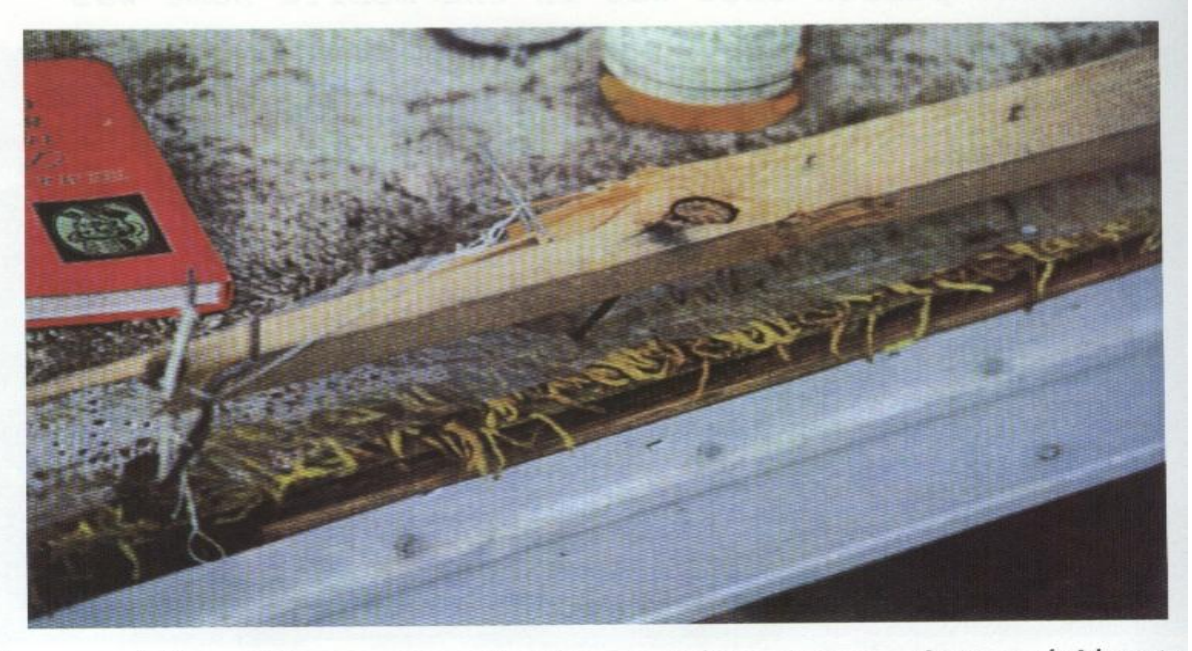
Figure 10. Close-up of the mobile home above idicating how the bottom plate was connected to the frame. Nails approximately 1 1/2 to 2 inches long held down the plate.