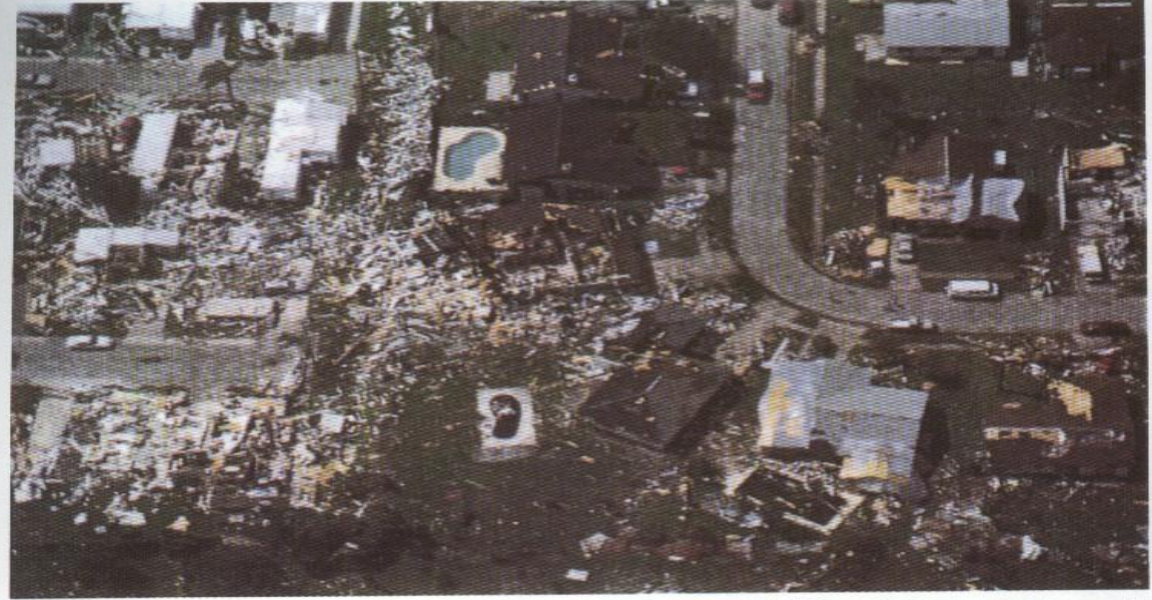
Figure 8. Aerial photo of the mobile home (above) that struck a home in a residential subdivision (center of photo). The mobile home moved from left to right.