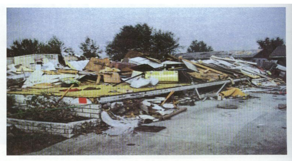
Figure 9. A mobile home in Park Royale Village that that was ripped apart. Note the frame and flooring of the mobile home is still tied down.