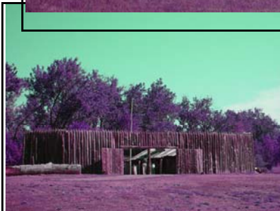
Replica of Fort Mandan - Winter Quarters for 1804-1805. Near Washburn, North Dakota.