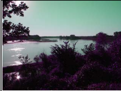
One of only a few stretches of free flowing water in the lower Missouri River basin. Photo near Lisbon, Missouri.