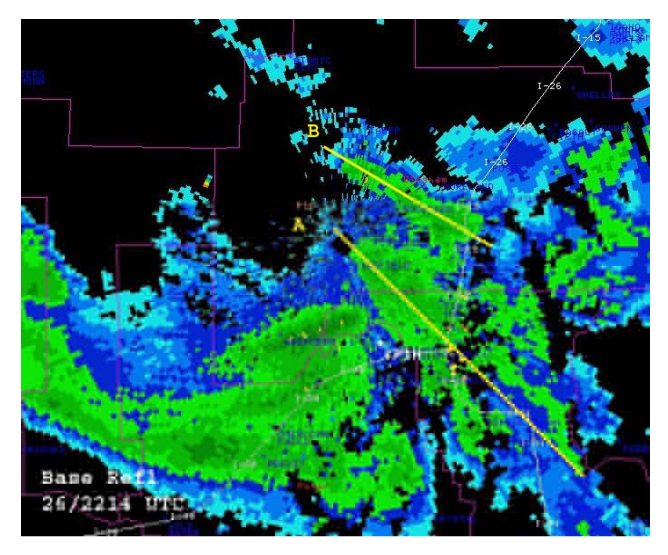
Figure 3. 2214 UTC 26 November 2005 showing convective axes.