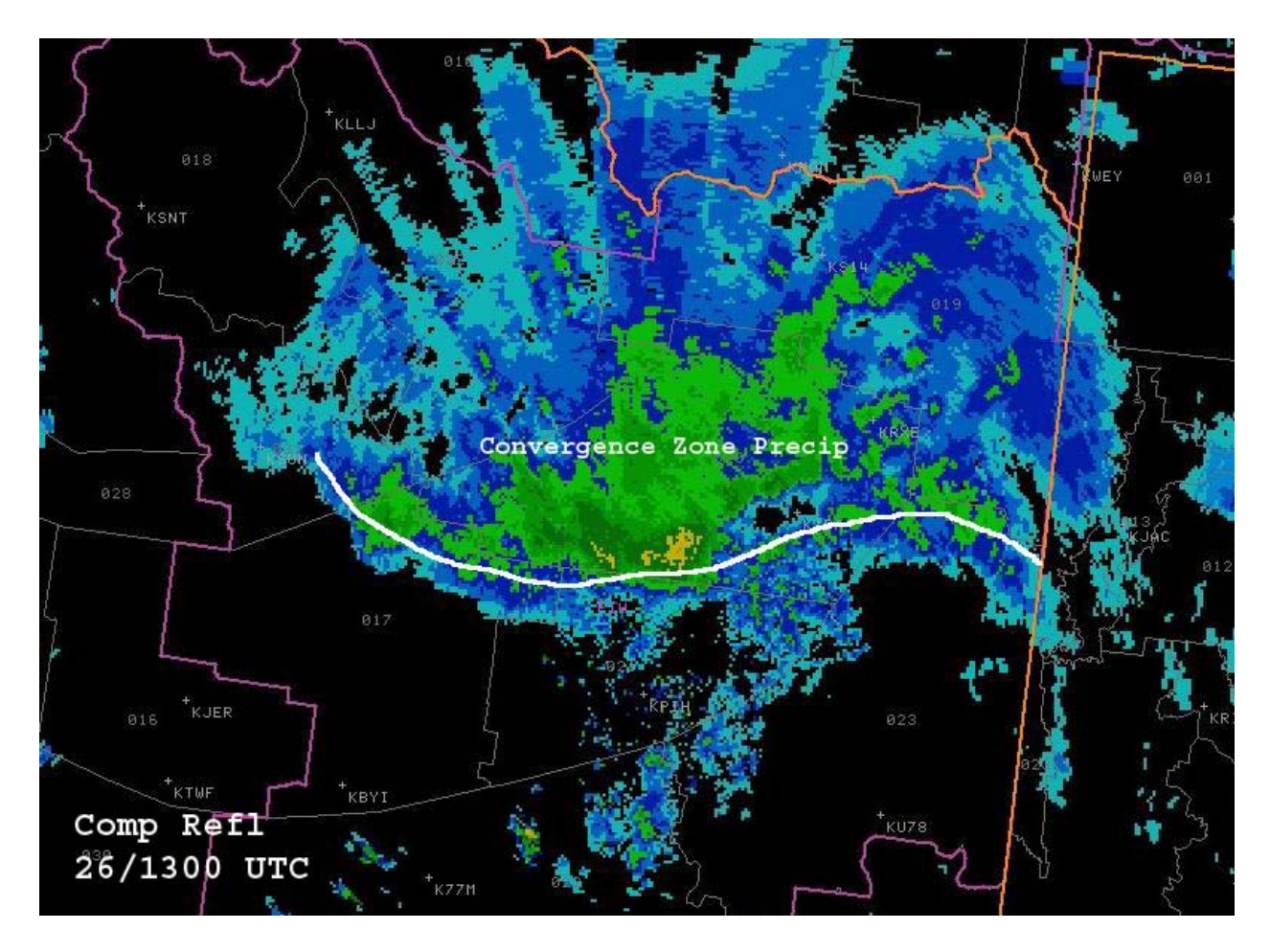
Figure 2. 13 UTC 26 November 2005 Composite Reflectivity