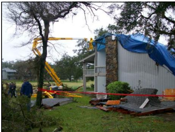
Workers put tarp on home that lost roof