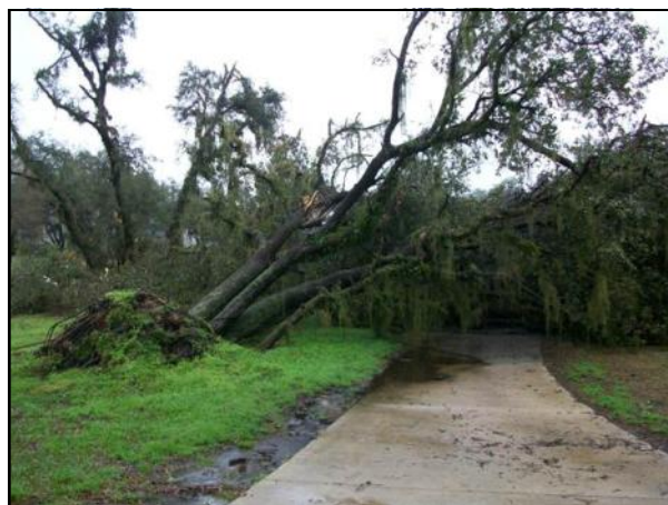
Numerous trees down or ripped apart